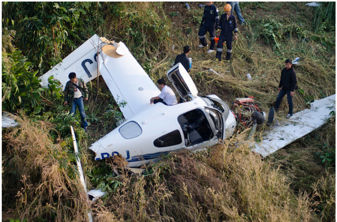
Proper independent oversight and investigation of flawed algorithms can help anticipate and improve quality, hence avoiding failures that lead to disaster.